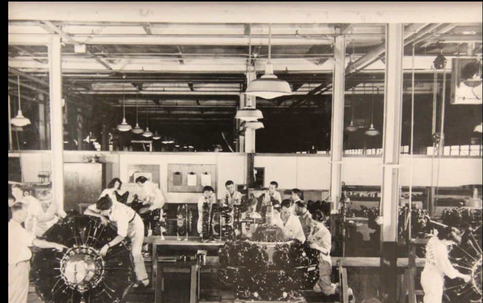
Aviation maintenance students at work in the Academy of Aeronautics' engine maintenance lab.