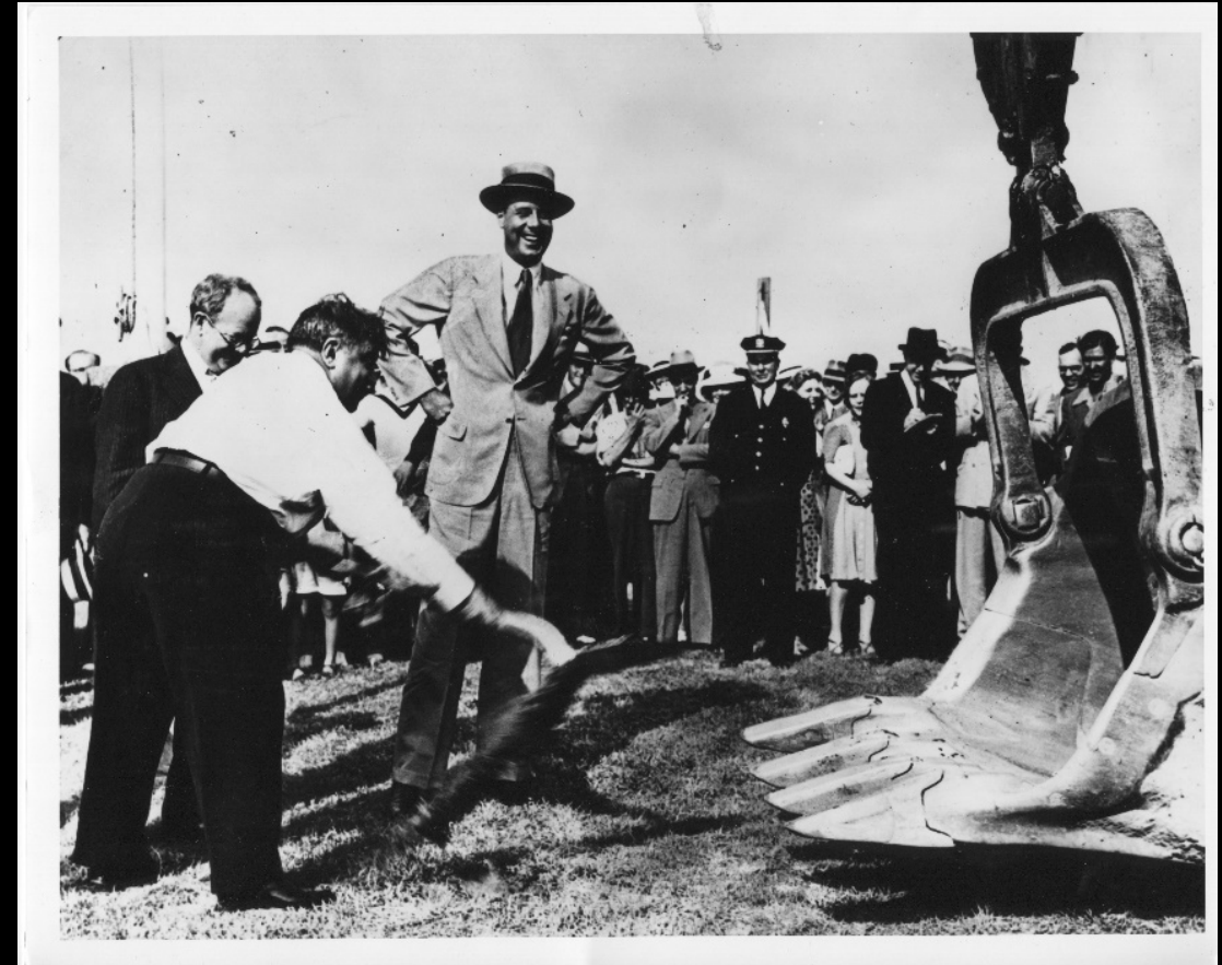
Mayor LaGuardia (with shovel) breaking ground for new airport

On October 15, 1939, Mayor Fiorello LaGuardia dedicated New York City's first commercial airport constructed on the edge of Bowery Bay. Originally named The New York Municipal Airport, in 1947 it was renamed LaGuardia Airport by the Port Authority of NY & NJ. Born out of Mayor Fiorello LaGuardia's indignation at being transported to Newark Airport when his ticket said "New York," the New York Municipal Airport quickly became the world's busiest airport, serving international flights throughout the 1940s. In the 1960's, the airport was expanded with the creation of the Central Terminal Building. Decades later, the east side of the airport was developed.