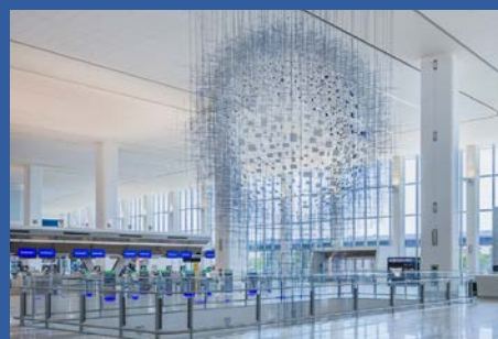
Terminal B Departures Level Interior