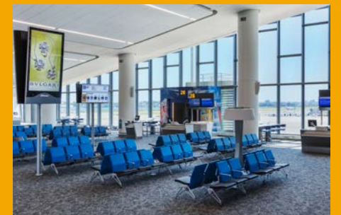
Terminal B Western Concourse Phase 1 opened August 2020