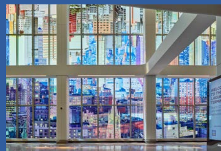
Art in Terminal B connector bridge to Parking Garage