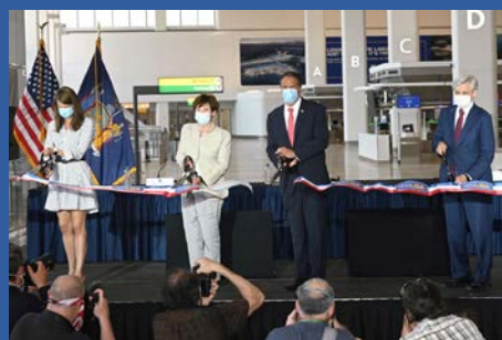
Ribbon Cutting for the Terminal B Arrivals and Departures Hall