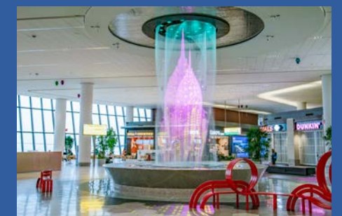
Terminal B's one-of-a-kind water feature