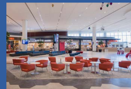
Spacious seating area in the new Terminal B