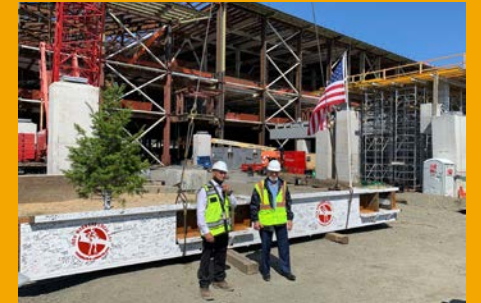
Terminal C Arrivals and Departures Hall steel completed July 2020