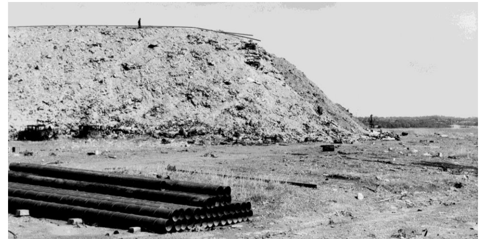
Early 1900's: The Infamous Ash Dumps